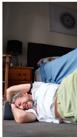
Dad's agony from a cluster headache

This is the moment an ambulance had... more