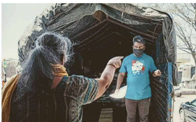
Distribution of care kits among waste pickers