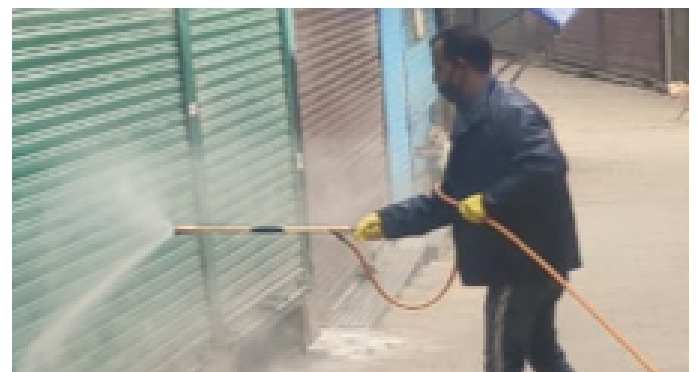
A safai karamchari disinfecting the streets, Shimla

Supervisors at SMU have been at the forefront of creating awareness within the community regarding the importance of adhering to government advisories, by personally talking to the workers in small groups. Many of the workers, who were finding the ill-fitted gloves cumbersome in their work, were persuaded to wear them nevertheless, for protection. In addition, most of the workers are wearing their monsoon specific uniforms, such as raincoats, for greater protection.