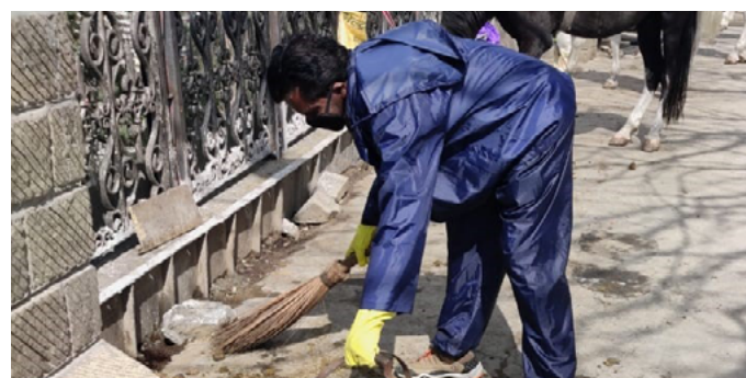
A safai karamchari sweeping the streets while wearing the monsoon-specific uniform and PPEs