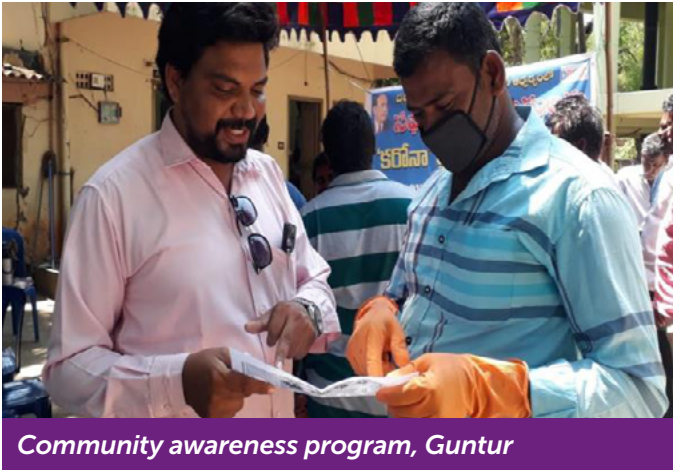
Community awareness program, Guntur