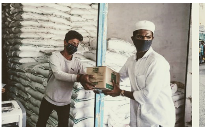
Packaging of relief kits in Bengaluru

The alliance has drafted and communicated the following demands to different government functionaries: