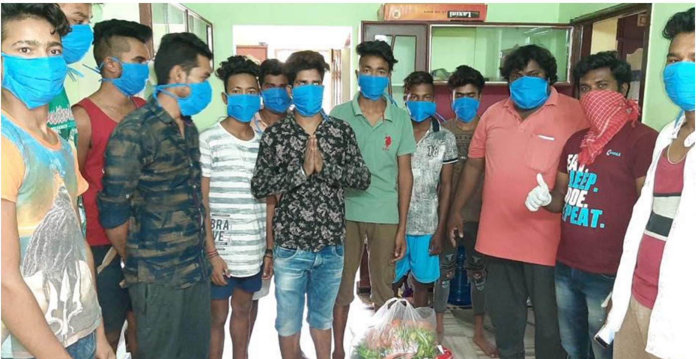
Distribution of essential provisions to migrant workers from Jharkhand, Guntur