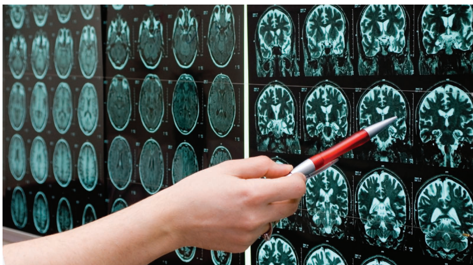
Rapid blood pressure lowering reduced bleeding in the brain and could reduce the risk of death in stroke patients.

Intracerebral haemorrhage (ICH) is the most serious type of stroke that results from rupture of a blood vessel within the brain. This is often the result of high blood pressure and affects over one million people around the world each year. Over one third of patients die early after the onset of ICH and most survivors are left permanently disabled. The aims of the pilot study were to determine the feasibility and safety of rapid lowering of elevated blood pressure to more 'normal' levels after the onset