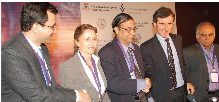
Signing of the Memorandum of Understanding between The George Institute, Indian Council of Medical Research and the University of Sydney.

More than 250 million people worldwide have type 2 diabetes, and have an increased risk of death due to cardiovascular disease. Around 16 million cardiovascular deaths occur each year, and the majority of these take place in developing countries such as India, where rates of heart attack and stroke have ballooned in the last few decades. The new Institute will address