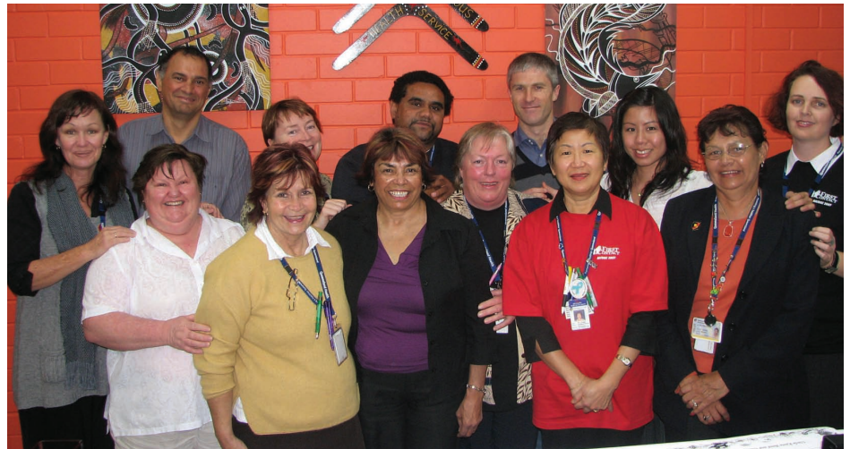
Staff at the Inala Indigenous Health Service, Brisbane (above) and WuChopperen Health Service, Cairns (left)