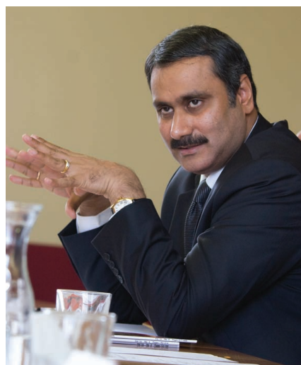
The meeting was an opportunity for Dr Ramadoss to speak about current health initiatives and priorities in India

The distinguished guests met with senior staff from The George Institute, the School of Public Health and the Faculty of Medicine to discuss potential collaborations and capacity building opportunities across a range of areas in health.