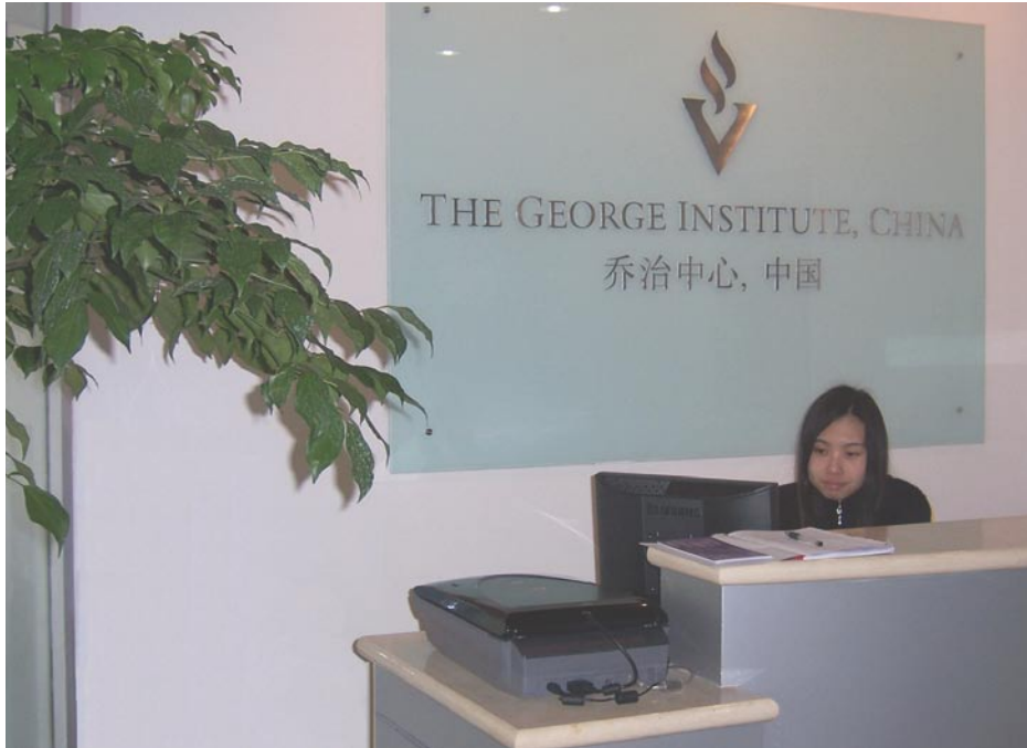
The new George Institute, China office in the Zhong Guancun District, Beijing

In recent years, The George Institute has embraced a range of research, policy and capacity-building activities in China. From road injury research to hypertension and stroke surveys, the Institute's work covers a broad spectrum of Chinese health issues, working in partnership with local experts to provide better health outcomes for the population.