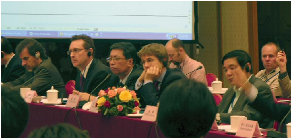
International delegates gather in Beijing, May 2006 for the third annual China Health Policy Roundtable

“The Roundtable series aims to bring International health experts together.”