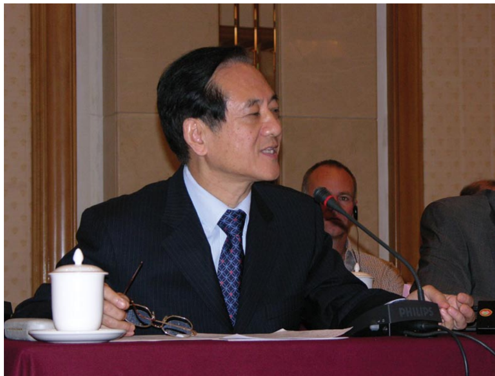
HAN Qide, Vice-Chairman of the Standing Committee of the China National People's Congress, China